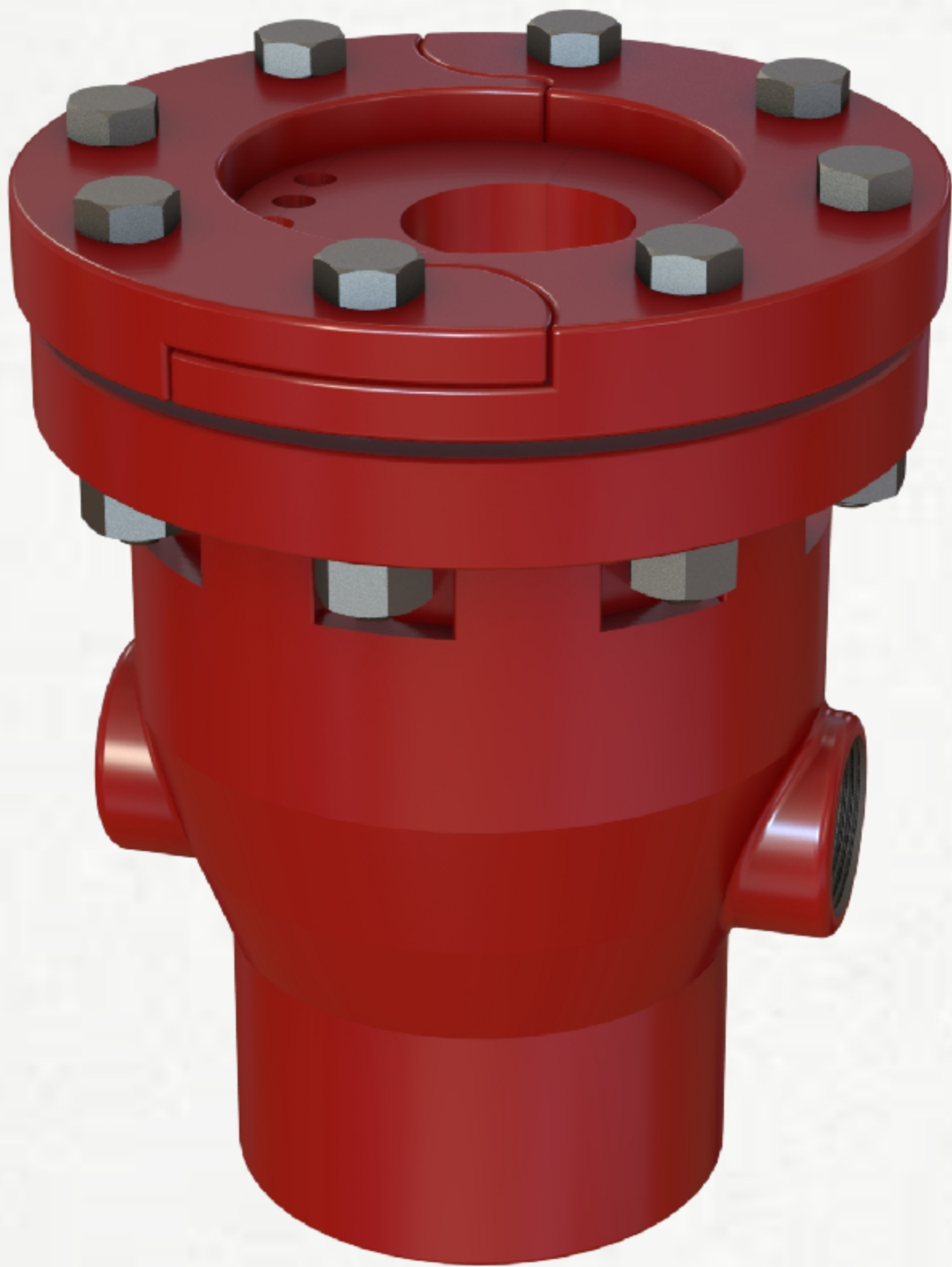
5-1/2" 8rd LTC X 2-7/8" 1,500PSI Model "HHS" ESP Tubing Head Complete #2 FLAT